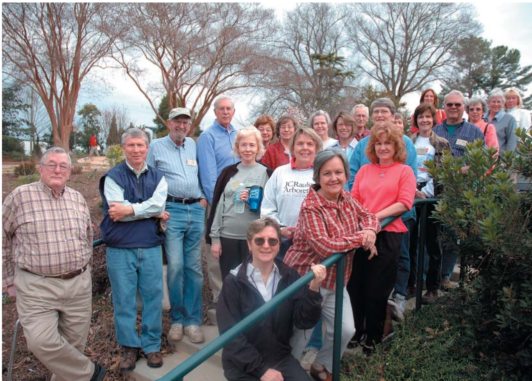
Above: Many of the Arboretum's dedicated volunteers.