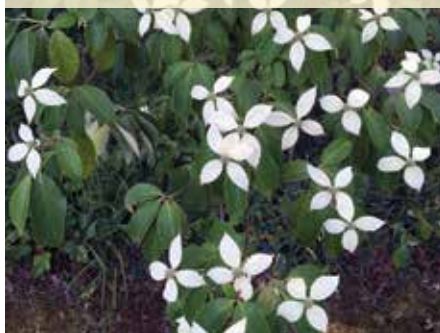
Laurie Cochran's Cornus elliptica 'First Choice'

Enjoy the accompanying photographs shared by our members (page 10, too). I hope they inspire you to take full advantage of each opportunity to add Arboretum plants to your garden. And bear in mind, many start from cuttings and are nurtured by Arboretum staff, summer interns, and volunteers. From our capable hands to yours—it is about the plants.