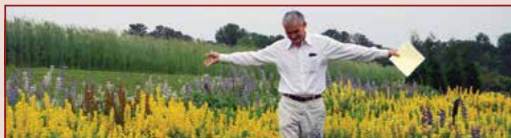
An Evening with the Plant Breeders Friday, October 2, 2015 – 5:30 PM–10:00 PM

This year's Open Days tour features five fabulous gardens in Raleigh, Gardner, Apex, Holly Springs, and Fuquay-Varina.