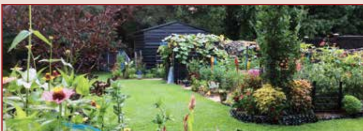
Garden Conservancy's Open Days "The Sandy Side of Raleigh" Saturday, October 3, 2015 – 9:00 AM–5:00 PM Sunday, October 4, 2015 – 12:00 PM–5:00 PM

This year's Open Days tour features five fabulous gardens in Raleigh, Gardner, Apex, Holly Springs, and Fuquay-Varina.