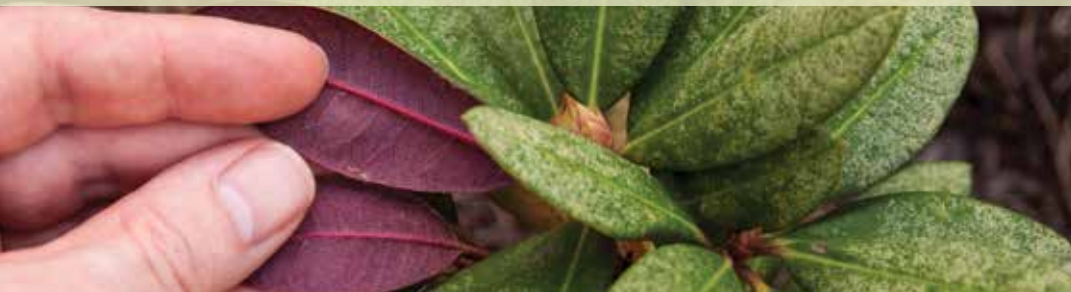
Rhododendron 'Wine & Roses'