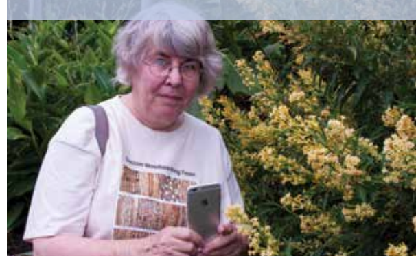
Elisabeth Wheeler photographs Cestrum parqui for the JCRA Facebook page

Want to volunteer in a more official capacity? Or want some help with your social media settings? Contact Kathryn Wall at (919) 513-7004 or kathryn_wall@ncsu.edu .