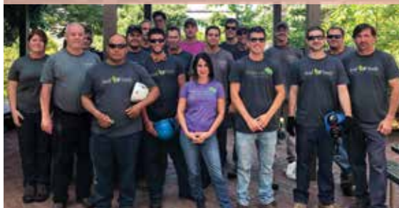
Staff from Leaf & Limb volunteered the services for a full day in June

The important thing to remember is that to make sure your gift is used in exactly the way you would like, it is helpful to have a conversation with us. We can make sure your legacy will continue our efforts to plant a better world.