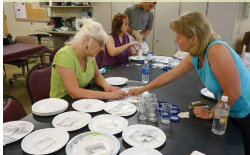
Index semina preparation

This isn't all that happens behind the scenes, but perhaps you can forgive us when it's clear that we haven't yet found the very last weed in the Arboretum plantings, now that you know that we might be hard at work in the JCRA nursery areas.