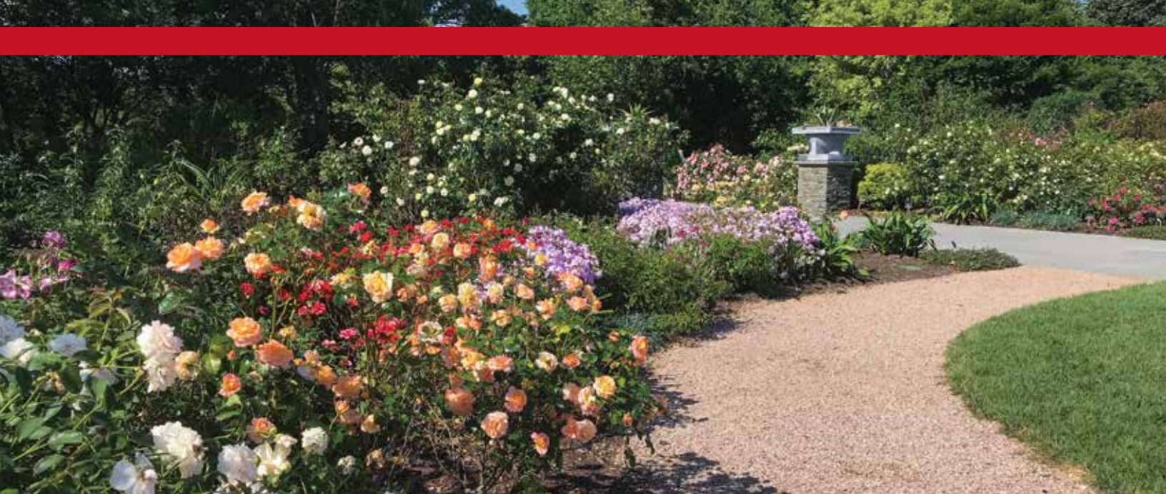
Vine support on the Bobby G. Wilder Visitor Center