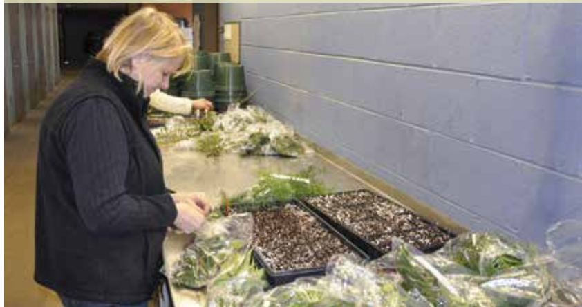
Winter propagation workshop

If you are interested in learning how to make new plants for yourself, keep an eye on the Web site at https://jcra.ncsu.edu/events/calendar/ for future dates. It might be that new options may also be offered focusing on grafting conifers and on a wider variety of seed propagation. Don't delay in signing up to get a spot for an exciting new adventure!