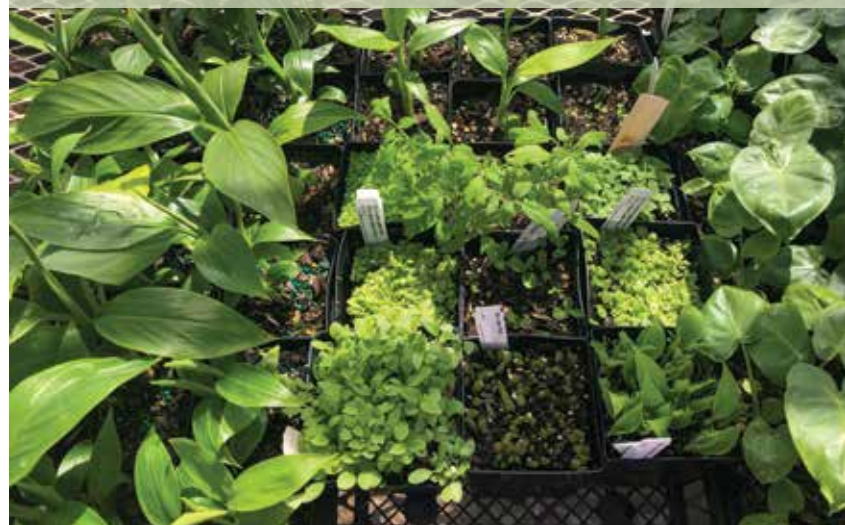
Seedlings for future plantings, distributions, and sales

Contemplating all of the possibilities is almost enough to cause one's head to explode. These are indeed exciting times at the JCRA. As always; thanks to all of you who help to make this possible and we hope you'll be part of our exciting future.