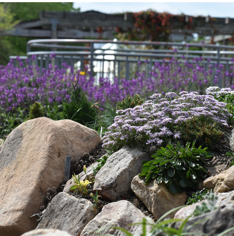
Crevice garden on rooftop.

Explore ten acres of beautiful gardens and discover plants collected from around the world. Take time to visit and return as often as you like. You'll find something different and exciting each time.